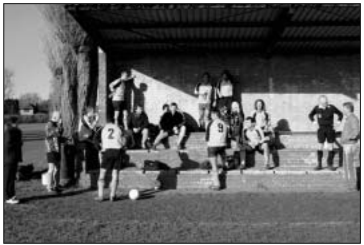
Half Time at the OA Veterans match against Old Foresters